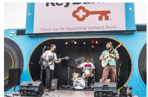
Live band playing at 2024 post-race party